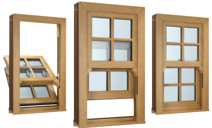
Irish Oak finish

What’s more, PVC-U requires very little maintenance to keep your windows looking as good as new. No painting or preservative treatments are required. An occasional wipe down with a damp cloth is all that’s needed to keep the frames looking as bright and attractive as the day they were fitted.